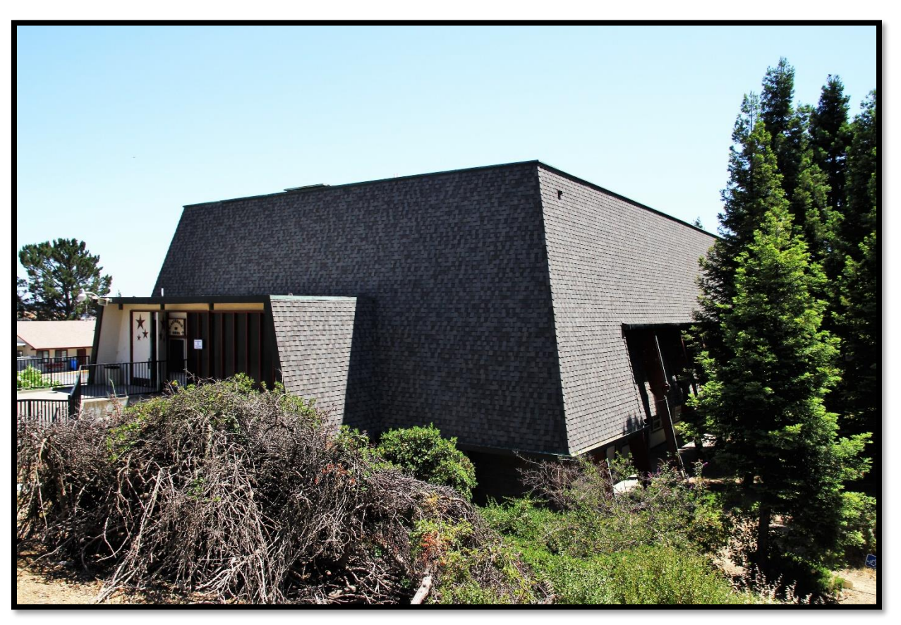
The Original Saint Catherine of Siena Church in Vallejo