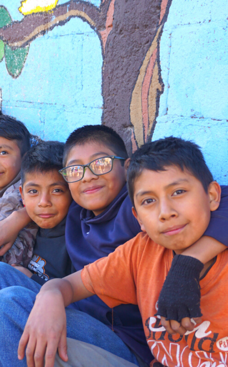
Guatemala Immersion Trip

“ It was not you who chose me, but I who chose you ”