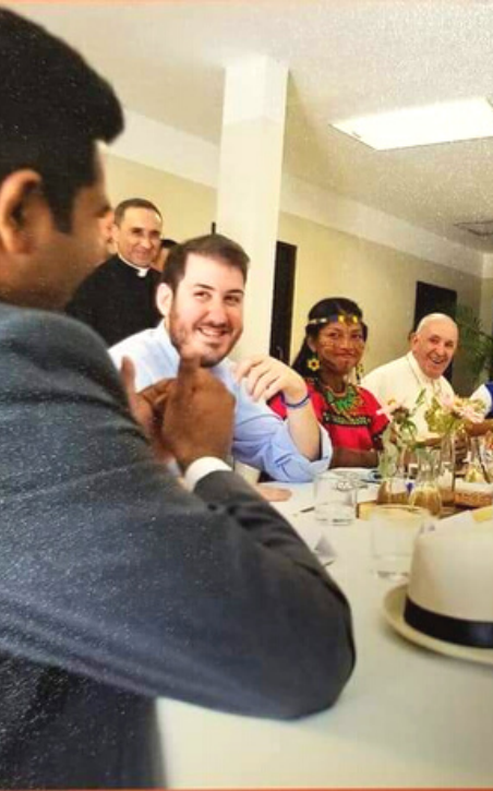
Pope Francis having a meal in Panama with 10 young adults from around the world.