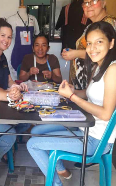
A youth joins co-op members at a bracelet-making workshop.