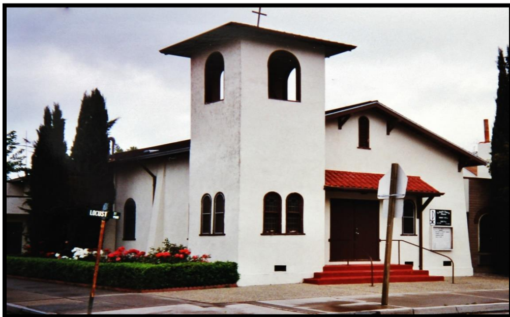
Saint Paul Church, Knights Landing