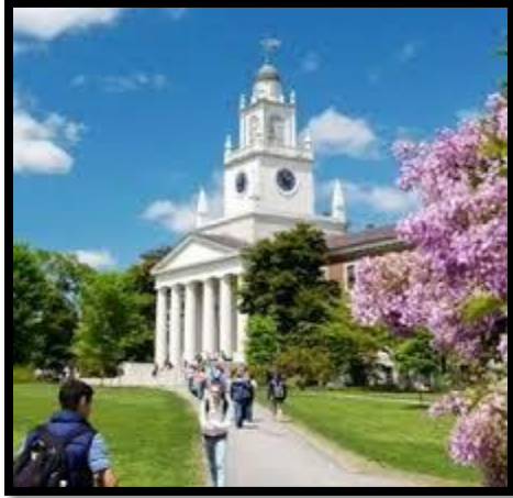
Phillips Academy in Andover