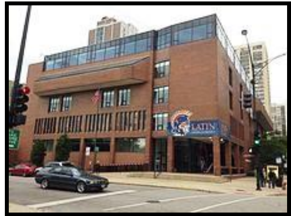
Chicago Latin School