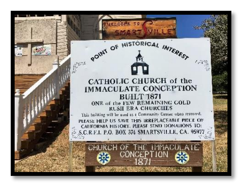
The Original Immaculate Conception Church in Smartsville