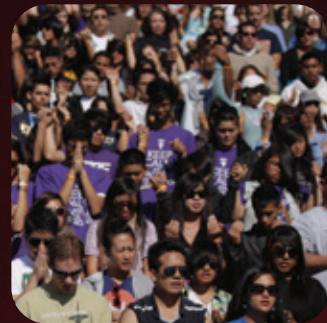
MASS WITH THE DIOCESAN BISHOPS MISA CON LOS OBISPOS DIOCESANOS