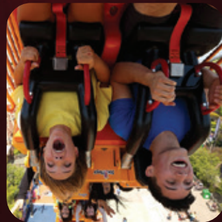
EXCLUSIVE RIDE TIME 7PM - 9PM USO EXCLUSIVO DE LOS JUEGOS 7PM - 9PM

SATURDAY, SEPTEMBER 14 SABADO, 14 DE SEPTIEMBRE 9AM - 9PM SIX FLAGS DISCOVERY KINGDOM VALLEJO