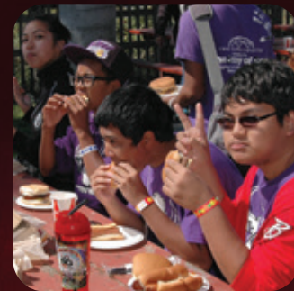
ALL-YOU-CAN-EAT LUNCH BUFFET TODO LO QUE PUEDas COMER EN EL BUFFET DE ALMUERZO