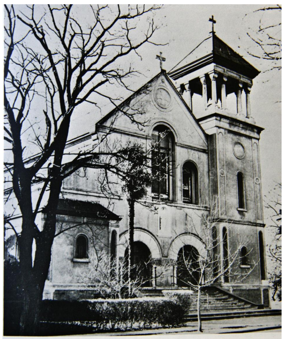
St. John's as it appeared in 1950 prior to the renovation of the 60's.

He was appointed pastor of Saint John the Baptist Church, Chico in 1951 before coming to Sacred Heart Church, Sacramento in 1958.