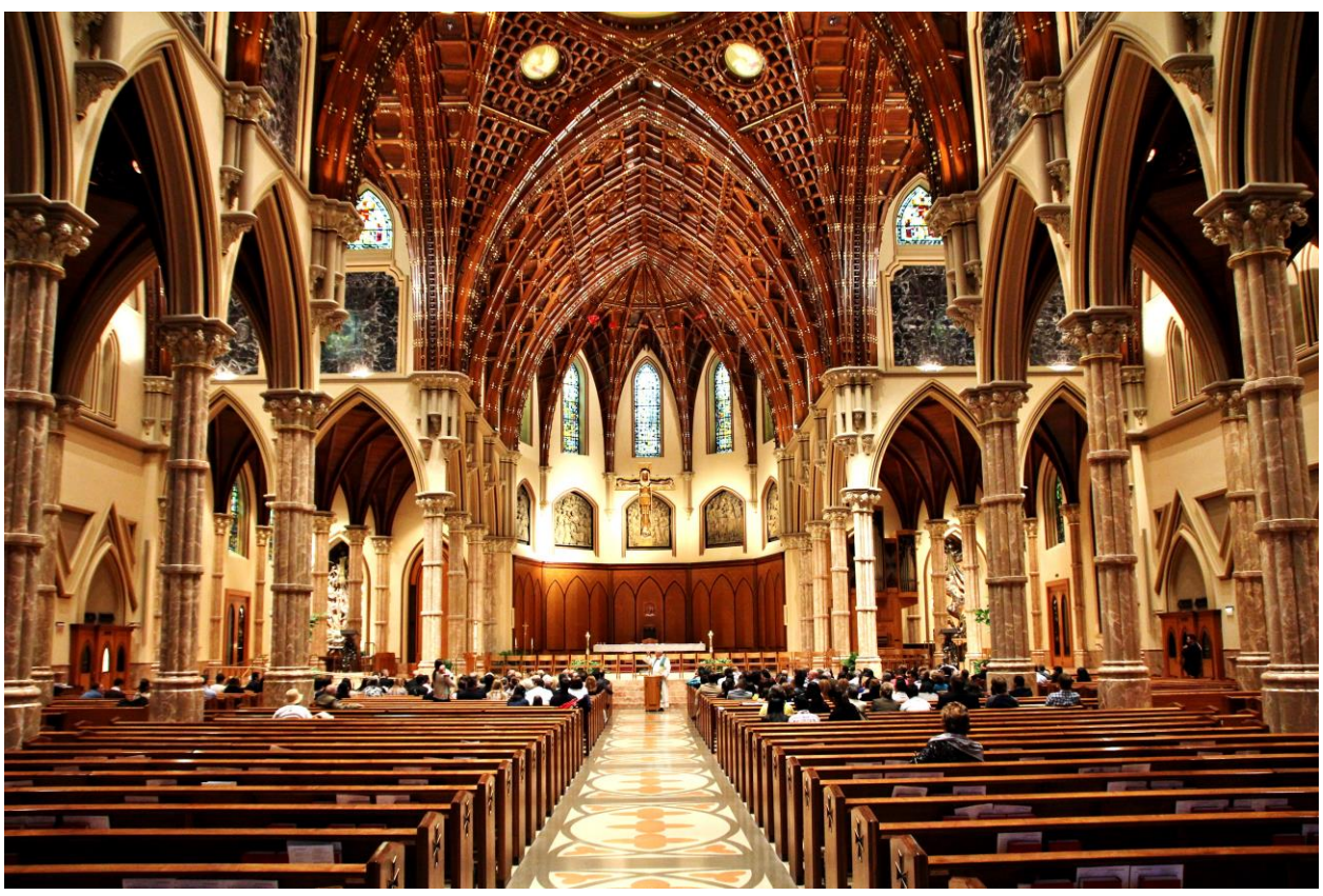
Interior of Holy Name Cathedral, Chicago