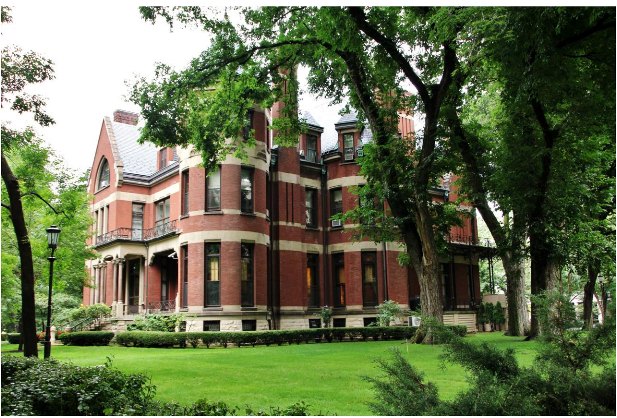
Residence of the Archbishop of Chicago To be continued in Part II