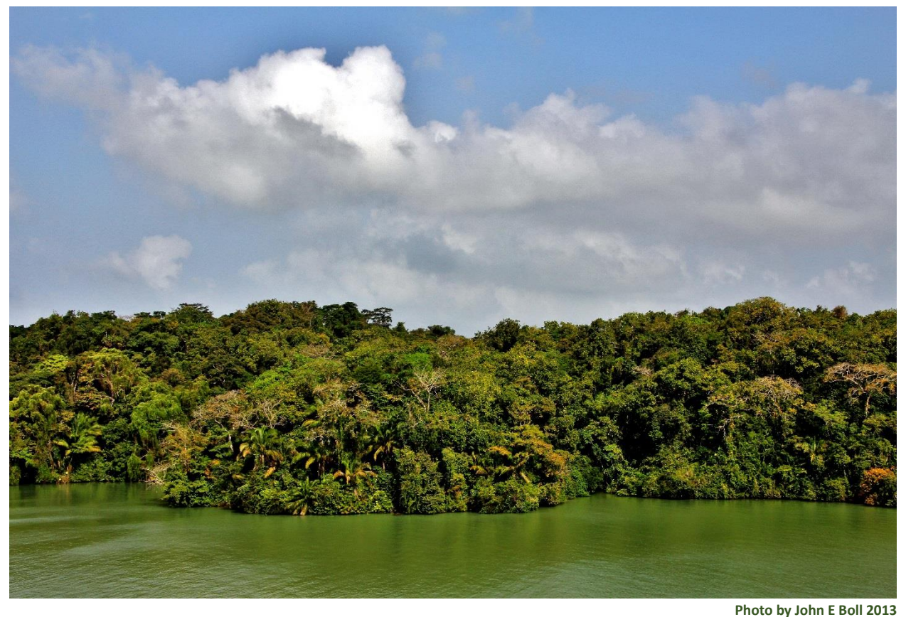
Panama Canal Zone where the Dominicans Crossed to the Pacific Ocean

On the third of November, the Crescent City passed between the islands of Cuba and Santo Domingo, both clearly visible. The following day the ship stopped at Jamaica to pick up passengers and on the sixth, during the night, it dropped anchor off shore from Chagres. An old castle with its fortress stood on the bluff.