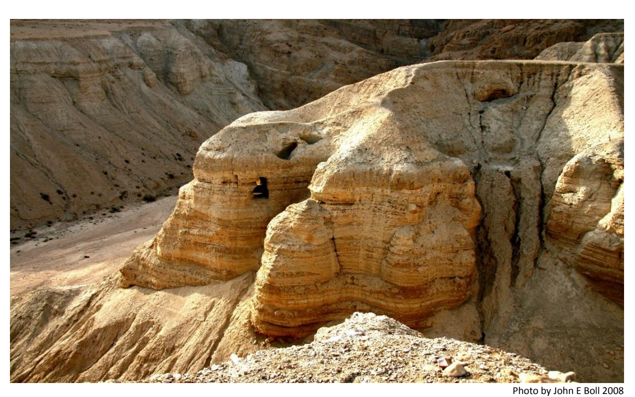
Cave near the Dead Sea where the Dead Sea Scrolls were Discovered in 1946