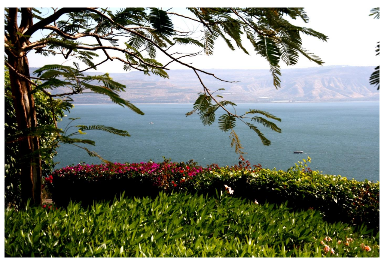
Photo by John E Boll 2008 Lake of Galilee from the Mount of Beatitudes