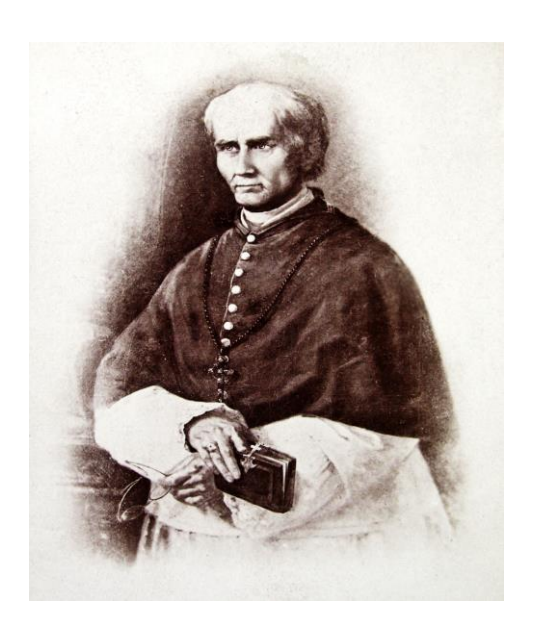
Archbishop Joseph Sadoc Alemany, OP Archbishop of San Francisco

service to the Church of California. For the rest of the century the majority of priests of San Francisco and Sacramento were from All Hallows. In this way California became one of the most concentrated mission fields of the College.