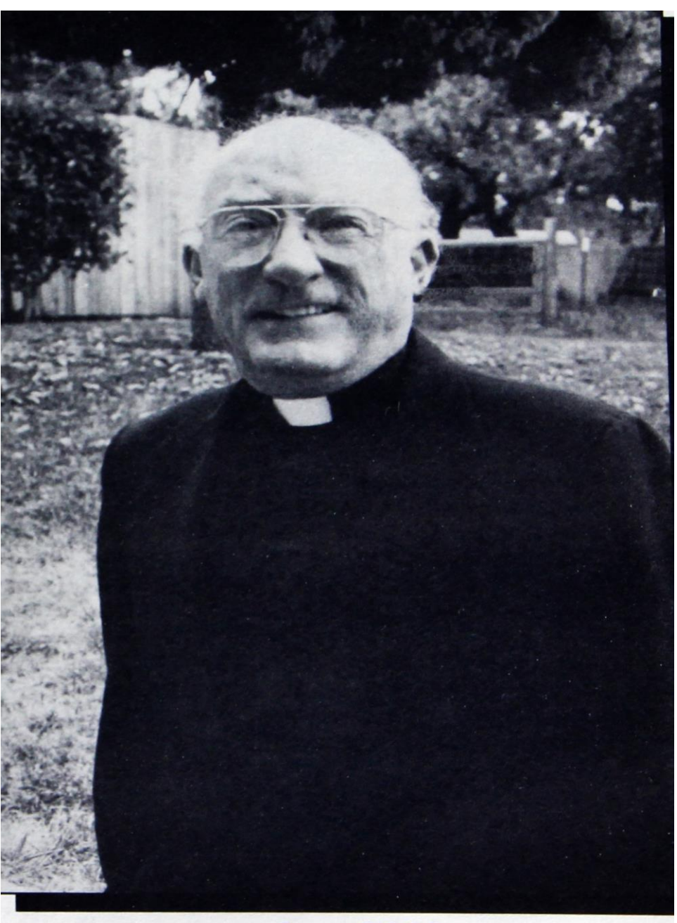
June 2000 Auburn, California