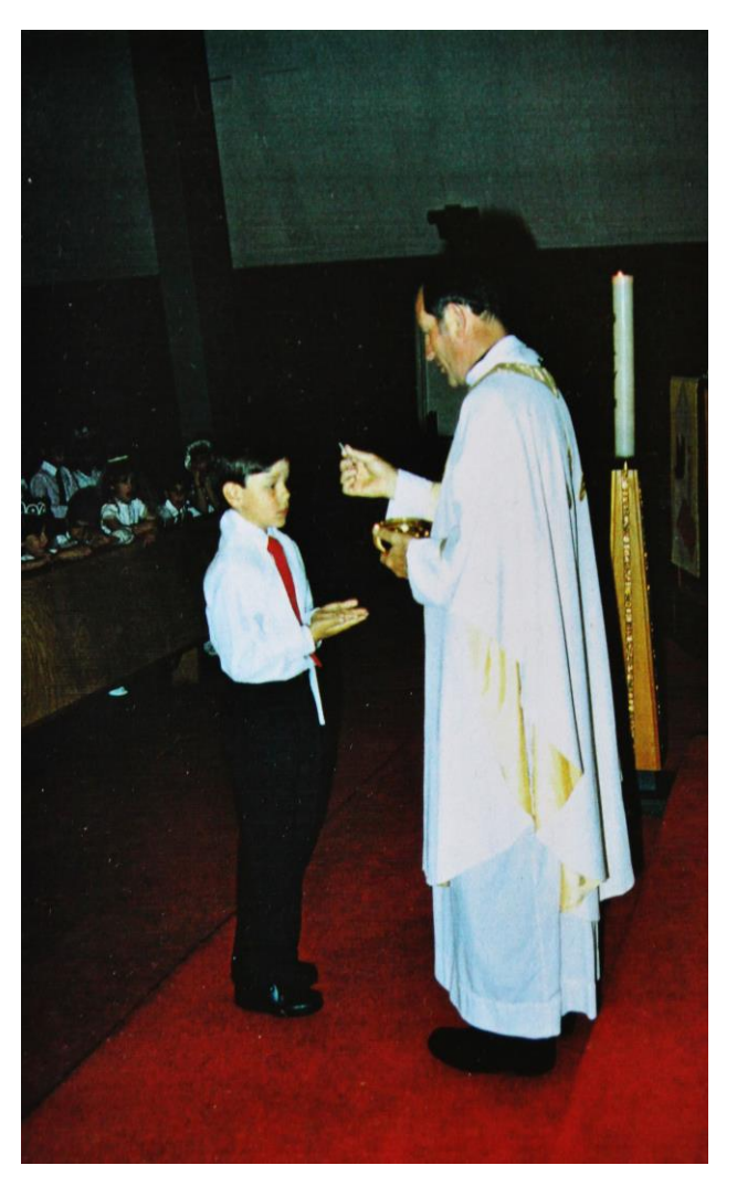
A First Communion in Folsom